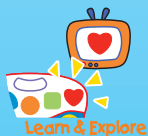
Learn & Explore

The Watch & Learn Mode functions as a learning video. With over thirty minutes of stimulating images and playful animations, toddlers will be introduced to a variety of learning curriculum including baby sign language, colors, shapes, numbers, vocabulary and much more.